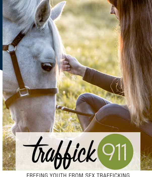
FREEING YOUTH FROM SEX TRAFFICKING